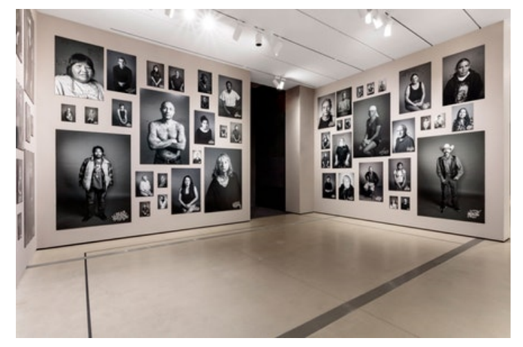
Installation view: Shirin Neshat: I Will Greet the Sun Again, The Broad, Los Angeles, 2019.

in Neshat's career and in the exhibition's narrative, leading up to her newest work. Both filmed in the US, Illusions and Mirrors (2013) and Roja (2016) are dreamlike short videos representing surreal confrontations of young women as they navigate strange landscapes devoid of a specific time or