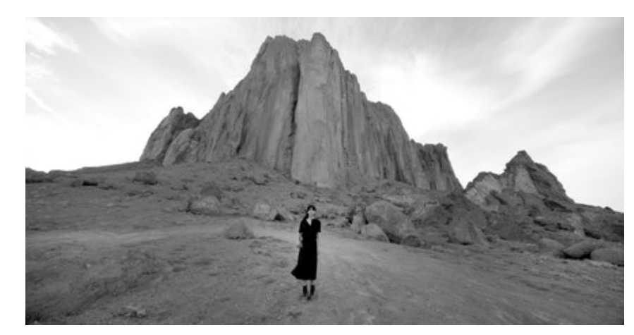
Shirin Neshat, Land of Dreams, 2019. © Shirin Neshat. Courtesy the artist, Gladstone Gallery, New York and Brussels, and Goodman Gallery, Johannesburg, Cape Town, and London.

dreams, to portray an allegory for the current political administration and its efforts to expose, document, categorize and control individuals. A final quote from Abbas Milani's Tales of Two Cities: A Persian Memoir (1996) concludes the exhibition as one exits the gallery: "Exile